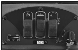
The ST 26 inch disc model – provides simple operation and robust scrubbing controls.