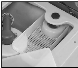
An integrated debris catch cage traps and collects drain clogging debris.