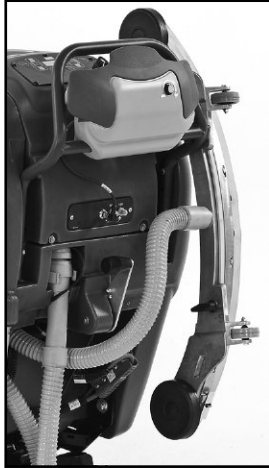
A built-in squeegee hanger makes transport easier and reduces trip and fall accidents.