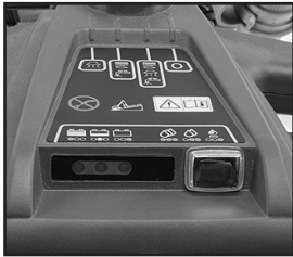
Electronic solution control for low, medium and high flow.