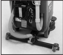
Center-pivot squeegee system employs a gas spring for maximum blade pressure to ensure complete dirty solution pickup in both forward and reverse.