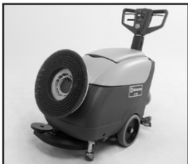
Brush stored on front for ease of transport.

Wrap-around ergonomic handle system provides operator comfort