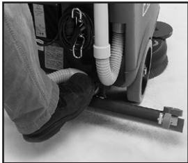
Foot-activated squeegee lift for easy operation.